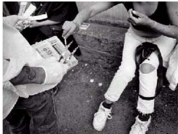
An alley patrol volunteer helps ensure that used syringes are discarded safely