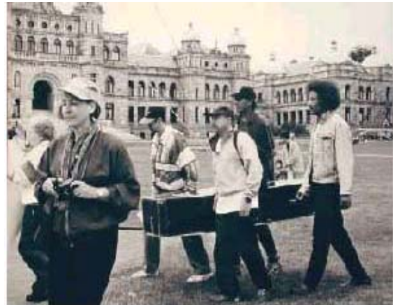
VANDU members carry a coffin to the steps of the provincial parliament buildings in Victoria

The Vancouver Area Network of Drug Users (VANDU) is a group of users and former users who work to improve the lives of people who use illicit drugs through user-based peer support and education. The population we serve includes people in the Downtown Eastside who self-identify as drug users, people on methadone, and street users of prescription drugs. Many VANDU