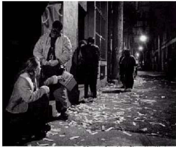
A VANDU alley patrol volunteer stops to exchange syringes and provide a kind word in a downtown alley

HIV infection and overdose. The VANDU volunteers provide sterile injecting equipment to help prevent the spread of HIV and hepatitis C, collect used syringes, and offer a kind word to the people they meet. As well, all alley patrol volunteers are trained in first aid and CPR. Alley patrols generally run when the needle exchanges are closed at night.