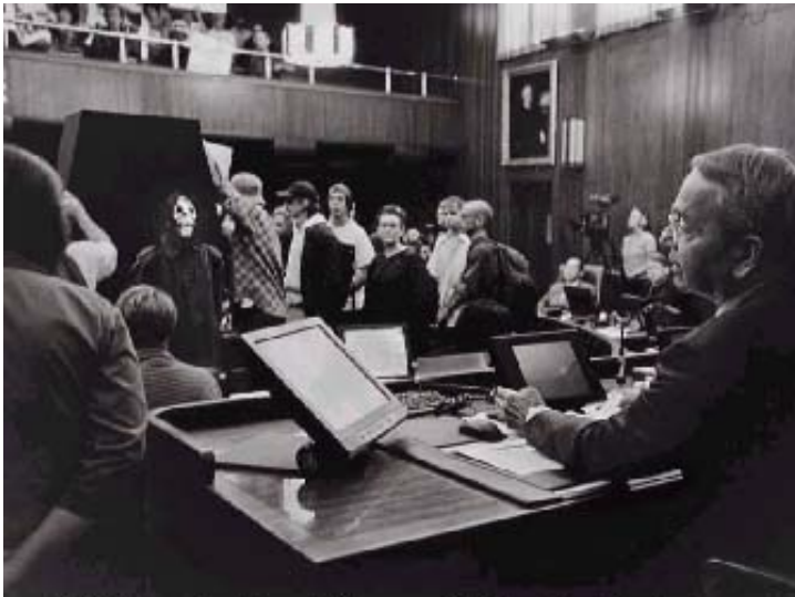
VANDU members interrupt a Vancouver City Council meeting after the Mayor announces a 90 day moratorium on the creation of new services for drug users. The Mayor halted the session and gave VANDU members time to voice their concerns

Almost everyone interviewed agreed that VANDU's primary strength is its ability to engage users on their own turf. This was a common theme that emerged from discussions with VANDU members and non-members alike. The belief is that because VANDU is driven by drug users, it is well positioned to help users in many ways. A funder noted: "VANDU is ideally positioned for secondary and tertiary prevention."