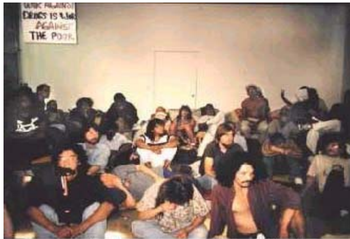
“A war against drugs is a war against the poor” reads a sign behind drug users settling for floor space at an early VANDU meeting held at the 4 Squares Street Church

Prior to these meetings, drug users had little input into discussions about the “health emergency” and the proposed responses. As one founder stated, “the voice of drug users had never been heard in