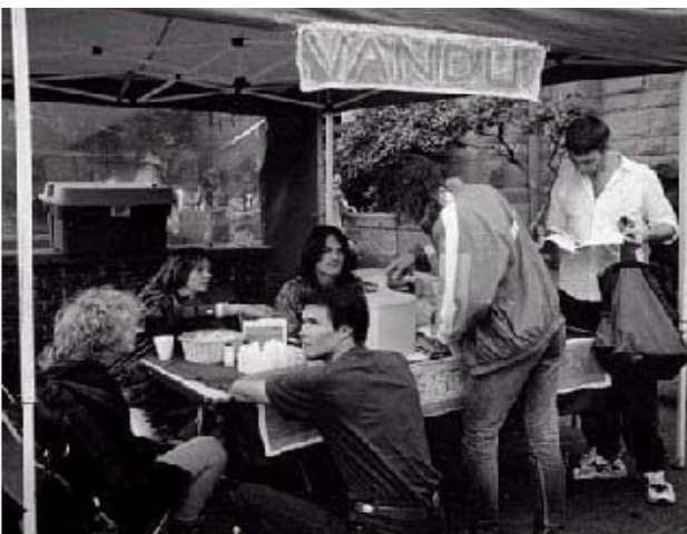
VANDU street program volunteers work the VANDU table at the corner of Hastings and Main Streets

syringes from several of the neighbourhood's low-income hotels. A service provider noted, in reference to VANDU's efforts to clean up improperly discarded syringes in the Strathcona neighbourhood, that "they wanted to show that users could be part of the solution." A funder, in referring to the hotel